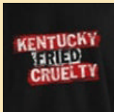
Kentucky Fried Cruelty T-Shirt